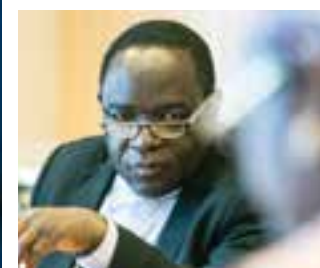
Federica Mogherini (bottom right)