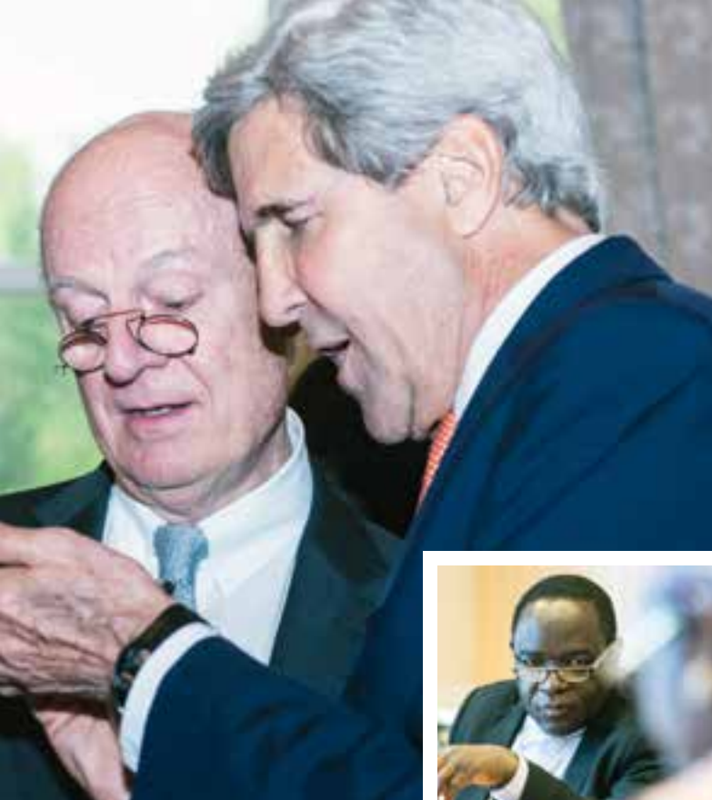
Staffan de Mistura and John F. Kerry (top left)