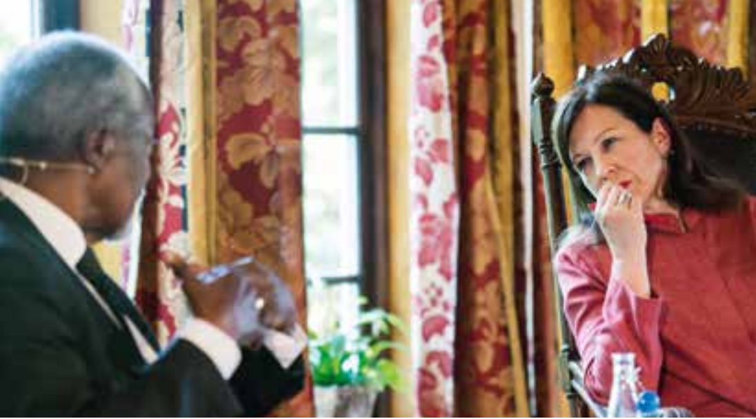
Kofi A. Annan and Lyse Doucet (top left)