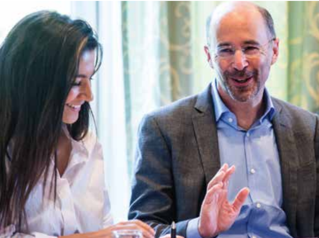
Mohammad Javad Zarif, Federica Mogherini, Børge Brende, Retno L.P. Marsudi and John F. Kerry (bottom)